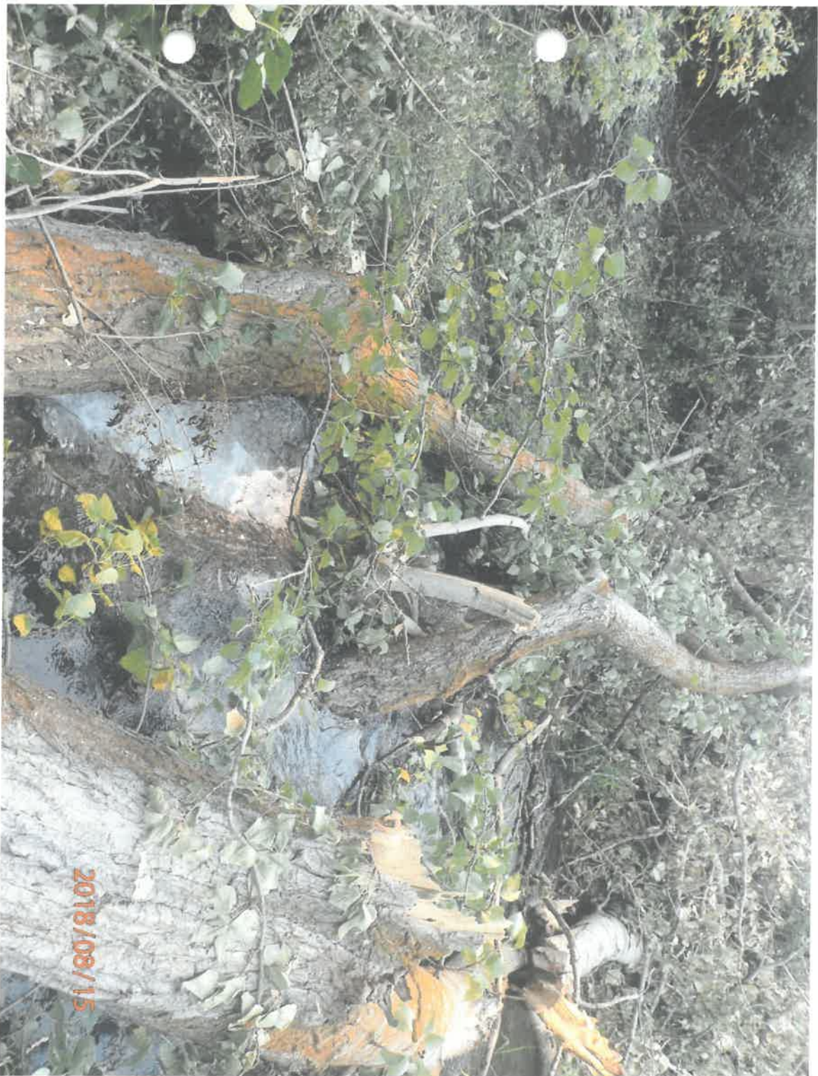
This photo is a close up of the trunks to be relocated to the left bank downstream to reduce flood risks to surrounding properties.